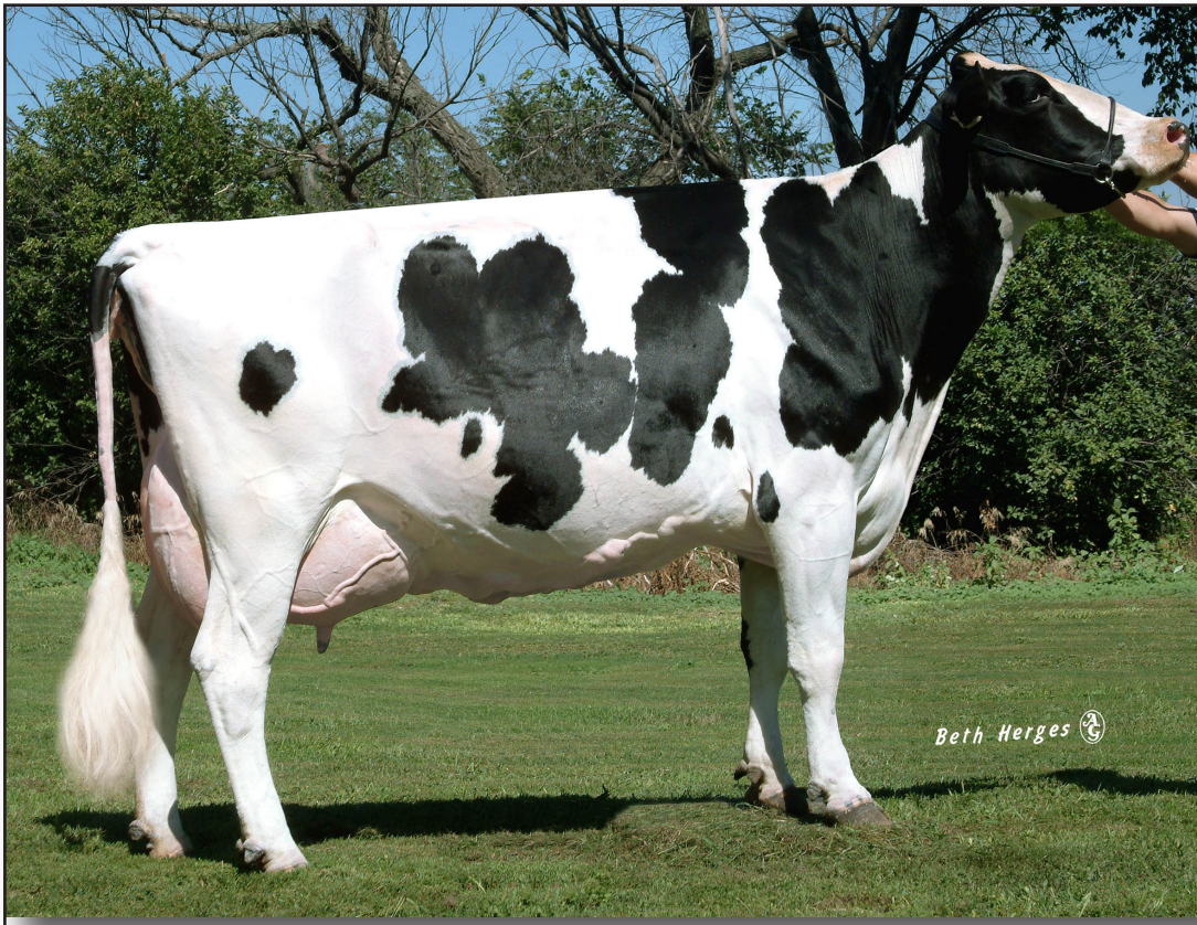
POST-LANE WINDSTAR PLUM (EX-91) 3rd Dam of Lot 2